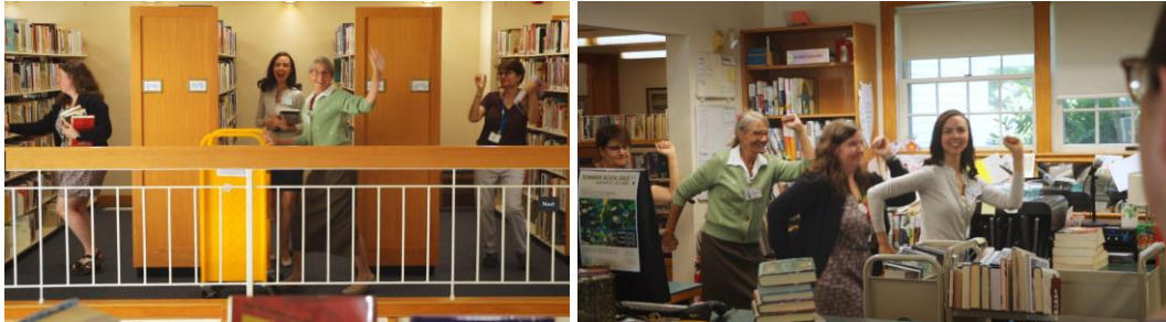
Photos: EPL Staff during the shoot of their promotional video "Join the Party" | WATCH IT HERE

Getting a library card is easy and empowering. It supports academic success, lifelong learning, and community connections.